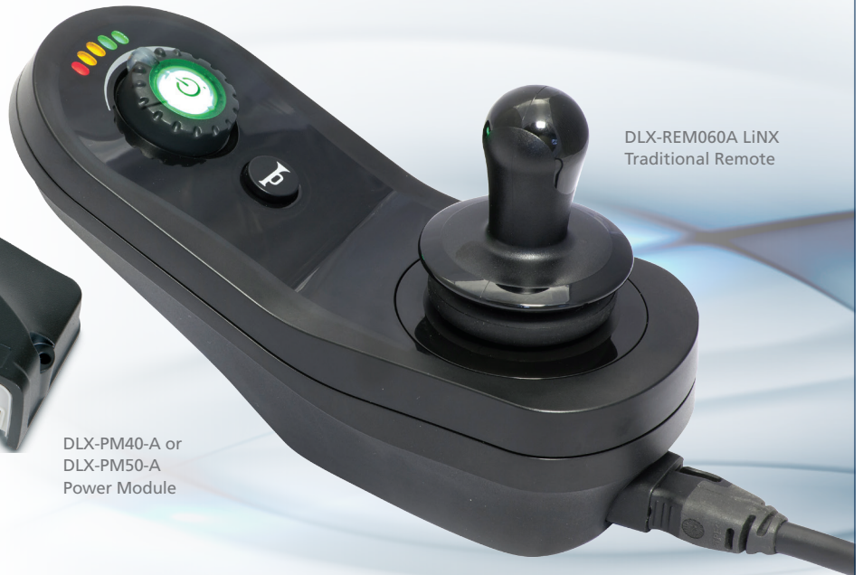
DLX-REM060A LiNX Traditional Remote

The LiNX LE 'traditional' system has been designed with a more conventional market in mind.