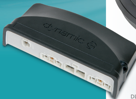
DLX-PM40-A or DLX-PM50-A Power Module